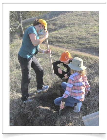
Acorn Planting Day – Volunteer oak planting team prepares soil for acorn-planting. Many families volunteered for this restoration activity sponsored by the Open Space Foundation.

We planted acorns in the flagged areas previously selected and marked. We had earlier prepared the sites by scraping a two-foot circle in the grass.