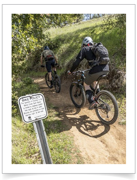
Not Infrequent – Cyclists ignore sign, at North Lime Ridge.

When designed for sustainability, open space staff aims for sustainability. For example, the path must be laid out and oriented on slopes minimize erosion. Erosion ruts damage the trail bed, making the trail less enjoyable for any use. Silt from erosion disturbs and reduces habitat for wildlife.