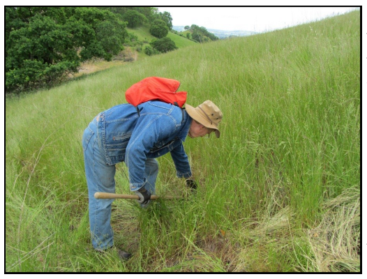
Bill Barnard searches and destroys single mustard plants at Sutherland--outliers that migrate from the pack and extend the reach of the invading army.

The group decided to focus on Shell Ridge Open Space because its mustard infestations were the broadest, covering